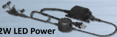
12W LED Power Supply with Photocell

The 12 Watt Transformer powers up to 16 LED deck lights, while the 50 Watt Transformer Kit includes a Programmable Timer, a Dimmer with Remote, and can power up to 65 LED deck lights.