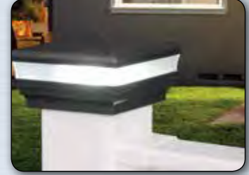
Available in White, Almond, Clay & Black