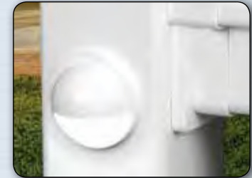
Available in White, Almond, Clay & Black