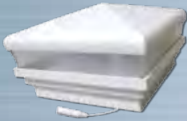
Available in 4" & 5" White • Almond Clay • Black