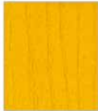
Post Yellow C-64