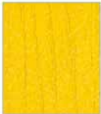
Marker Yellow C-62