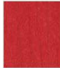
Bright Red C-32