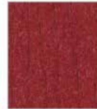
Dark Red C-30