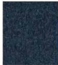
Patriot Blue B-41