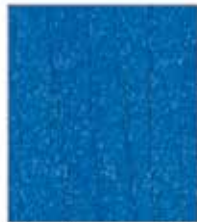
Royal Blue B-42