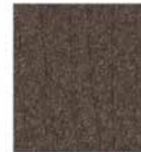
Dark Chocolate B-98