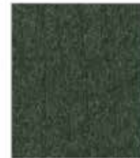
Dark Green B-70