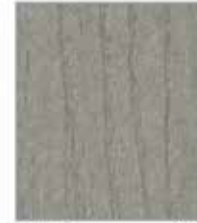
Earth Gray B-58