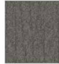
Dark Gray B-55