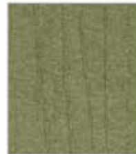
Fern Green B-74