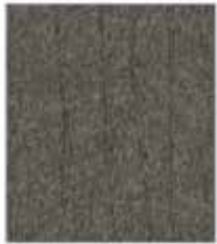
Charcoal Gray B-54